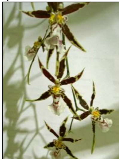
Brassidium Golden Gamine 'White Night'.